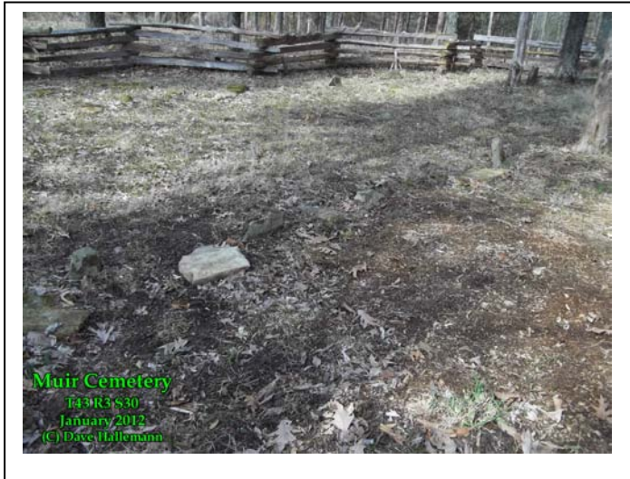
The above picture show the cleaned up inside with the wonderful new split rail fence.