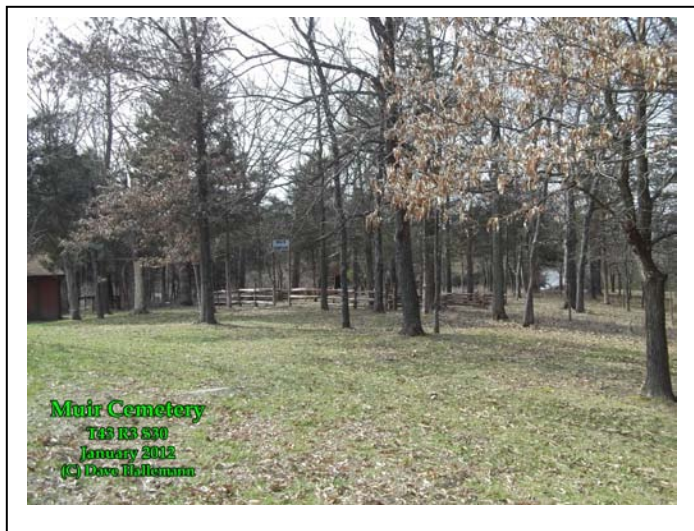
The above picture is looking from Mrs. Lawrence's driveway across the side yard. At right shows the new entranceway with sign.

The following pictures are of the restored cemetery;