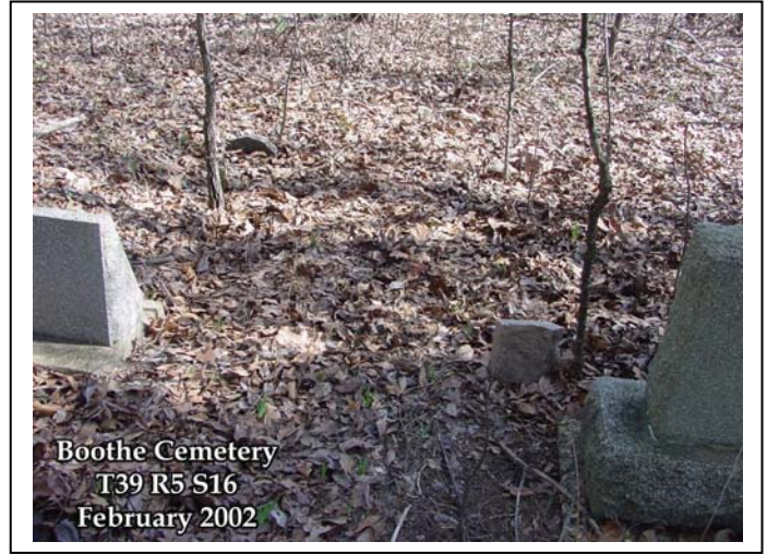
Granite Blocks Used for Footstones