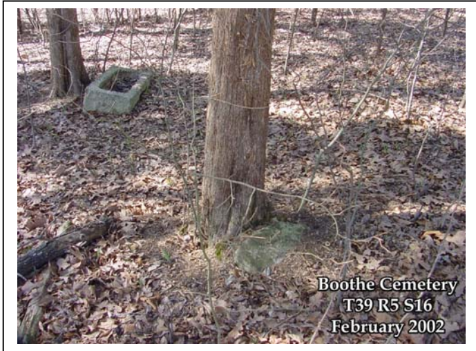
Possible Fieldstone Marker Against Tree