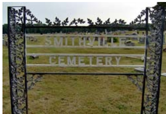
Buried Smithville Cemetery