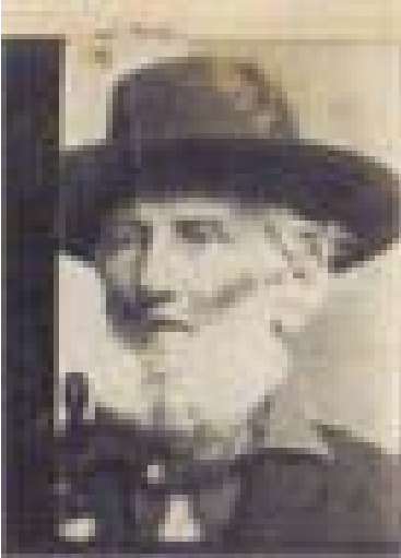
William Campbell Longley 1761 – 1841

DECLARATION IN ORDER TO OBTAIN THE BENEFIT OF THE ACT OF CONGRESS PASSED JUNE 1832.